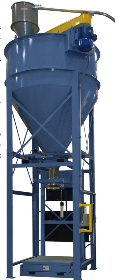
Mixer shown with vacuum loader and integrated bulk bag filling system

See back page for additional options and specifications.