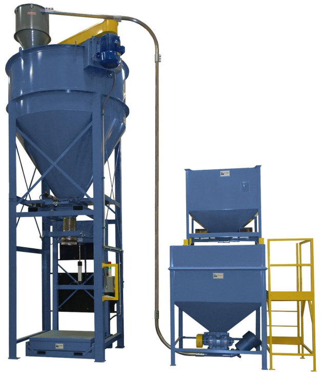
Pneumatic fill station w/ RAL, mixer, vacuum pump, receiver and automated bulk bag filler

See back page for additional options and specifications.