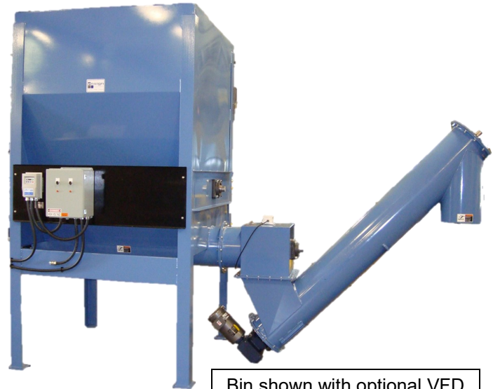
Bin shown with optional VFD and 12" discharge auger.

Ranging in sizes from 50 cubic feet capacity to 1000 cubic feet capacity, Ensign can provide in-plant storage bins to receive material from silos, rail unloading systems or gravity fill methods such as screw conveyors or dumpers.